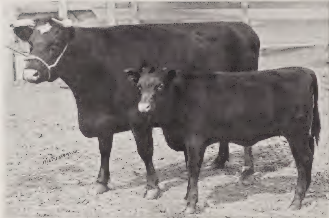
BUTTERFLY AND HEIFER CALF.